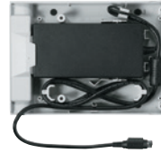
Optional power supply case secures cords under printer.